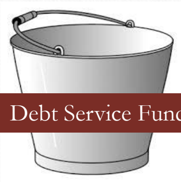
Debt Service Fund