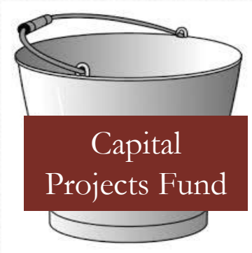
Capital Projects Fund