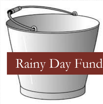
Rainy Day Fund