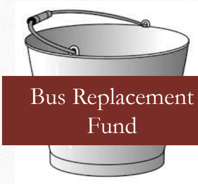
Bus Replacement Fund

Funded by State Legislature on per student (ADM) formula